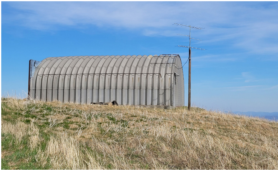
The Pond Mountain Motus Station in Ashe Co, NC. Antennas are mounted on a wood utility pole and the station's battery is charged by a solar panel. The receiver box and battery are housed inside this old airplane hangar.

The big gap in Motus coverage in the Southern Appalachians is being filled quickly with new receiver stations. The Mountain Wildlife Diversity crew installed its third Motus receiver station in February 2024 and its fourth station in April 2024. Each station entailed designing an installation customized to each site's limitations and infrastructure. The team found that learning about details of other Motus partners' installations was helpful. This report provides a brief summary of design elements for NCWRC's four mountain region Motus stations.