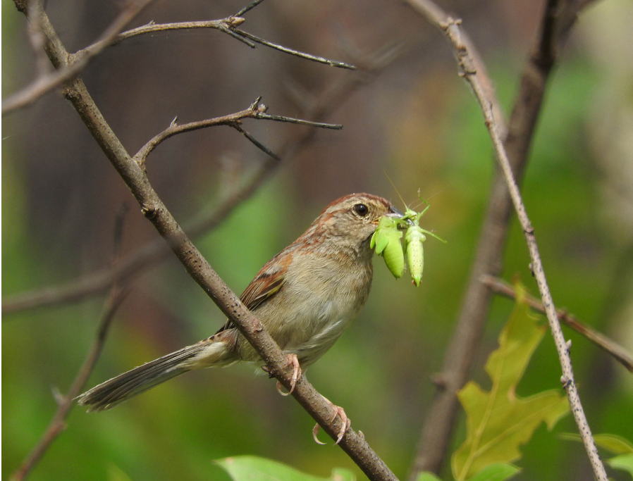
Bachman's Sparrow carrying food (CF), one of the many behaviors that can confirm breeding in a location.