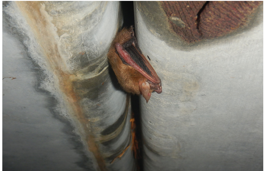
A tricolored bat roosting under a replaced bridge in January 2024 (Katherine Etchison)

Now that the project is halfway through, patterns in the results are beginning to emerge, particularly with tricolored bats. Current results show tricolored bat presence at about one-quarter of bridges surveyed, tricolored bat presence during winter and during the active season, and tricolored bat presence at "old" bridges more often than replaced bridges. This project will continue until all historic bridges are surveyed, which should conclude in May 2025.