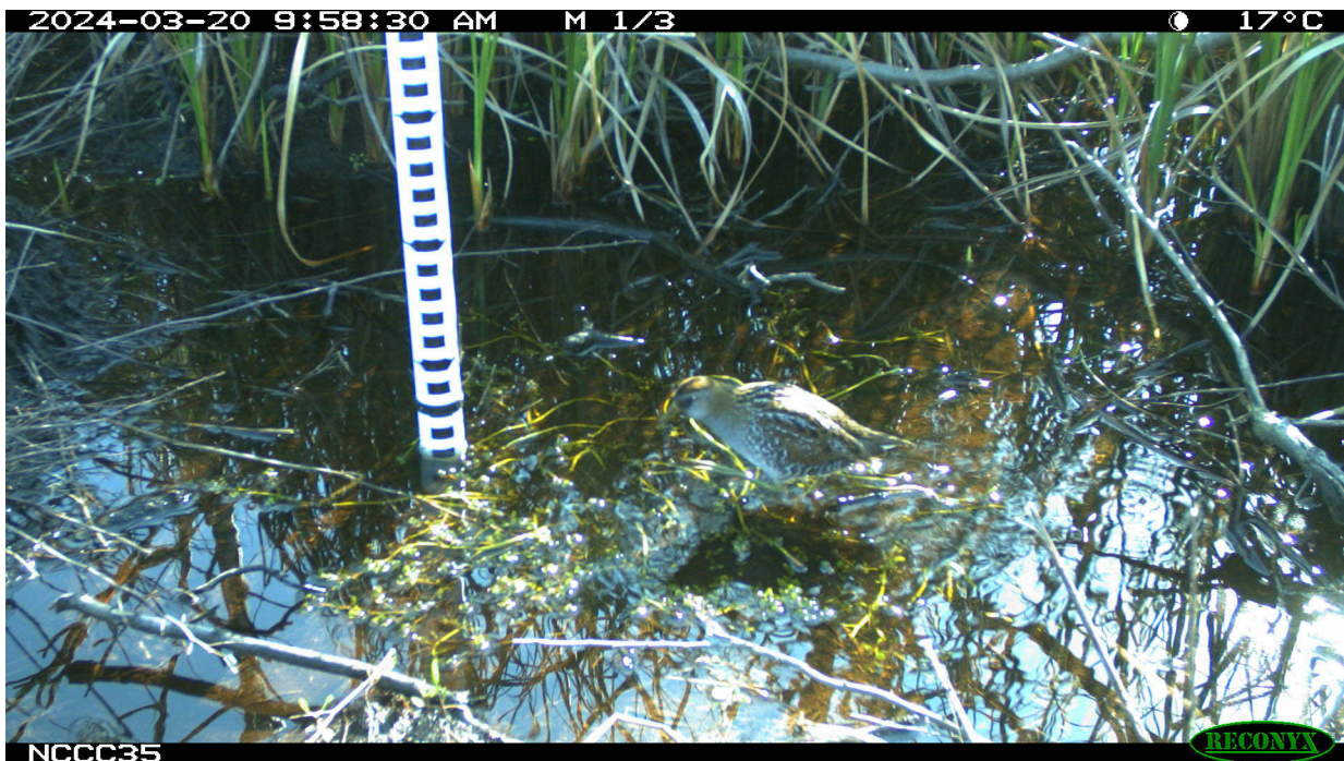
Sora captured on a game camera in high salt marsh area

of less than 3 cm, cannot tolerate water levels above 3 cm. Staff are employing game cameras to monitor water levels and take photos of wildlife by motion-sensors. One of the game cameras detected a Sora from March 20th to 31st, 2024. Sora use the same habitats as Black Rail. Staff are also deploying Autonomous Recording Units in potential Black Rail habitat to detect their calls. Black Rail and marsh bird callback monitoring surveys in high salt marsh will begin May 1st, at the start of the nesting season.