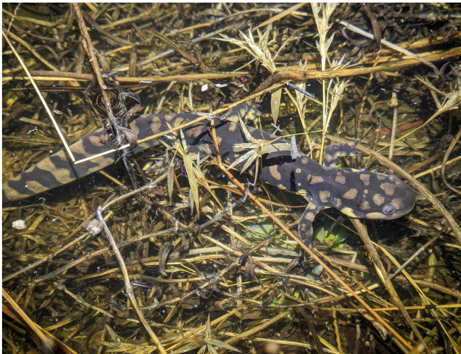
Aubrey H. Greene

PLEASE NOTE: Our State Listed species are protected from take and harassment so if you see them, please observe these animals respectfully, help them cross the road if needed (and if it's safe for YOU!), and leave them be.