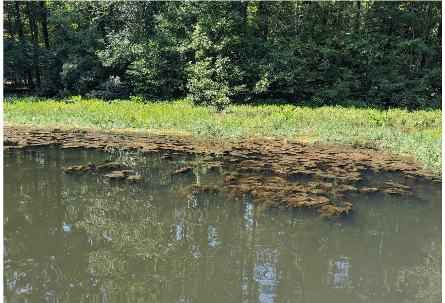
Lyngbya topping out in Lake Gaston.

Aquatic Wildlife Diversity staff are working with NC State University to determine the impacts of lyngbya and the treatment of lyngbya on native mussels. Lyngbya is a noxious, filamentous blue-green algae that forms dense mats along the bottom primarily in lakes and reservoirs. These mats persist all year long but can proliferate in the summer forming dense mats from the surface to the bottom. These mats become a nuisance to lake front homeowners as they are visibly unappealing and can inhibit aquatic recreational activities. To help manage this nuisance species, the lyngbya is treated with algaecides. Lyngbya has dermatotoxins and it's also unclear how these dense mats alter water chemistry and affect benthic organisms like mussels. To better understand the interactions between lyngbya and mussels, the Commission is using propagated tidewater muckets, Atlanticoncha ochracea in areas with and without lyngbya as well as areas where lyngbya is being treated with algaecides. The mussels have been placed in cages and will be monitored throughout the summer to document growth and survival. These findings will help guide management of this noxious species.