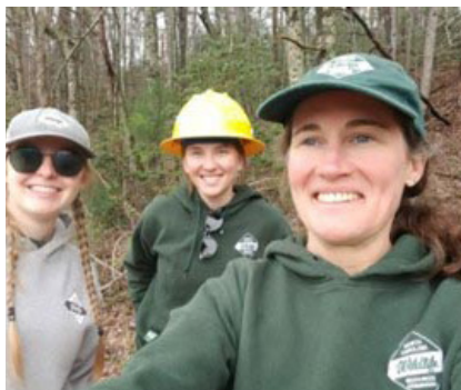
NCWRC staff members after attending the field portion of a two-day NCWRC chainsaw training course.

NCWRC staff recently participated in a couple training opportunities that will ultimately help improve our ability to restore and monitor mountain bogs. Bog turtles and their habitat – mountain bogs – are a high conservation priority in North Carolina. The bog turtle, Glyptemys muhlenbergii , is federally threatened (S/A) and state threatened. As part of our conservation efforts with this species, the NCWRC manages wetlands with known bog turtle populations. Unfortunately, many of these wetlands have more woody vegetation and more canopy closure than they had historically. Various factors have played a role in this change, including increased nutrient input, changes in land-use, development in the surrounding landscape, and changes from historical levels of beaver activity, and perhaps grazers and fire in some cases. Habitat management in these