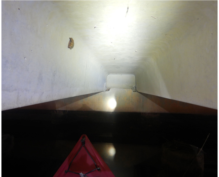
A tricolored bat roosting under an "old" bridge in January 2024 (Katherine Etchison)

During the 2024 winter surveys, tricolored bats ( Perimyotis subflavus ), a species proposed for listing as endangered by the U.S. Fish and Wildlife Service, were found roosting under seven bridges. The surveys occurred during an unusually cold period where nightly temperatures were in the 20°F to 30°F range, so it was surprising to see tricolored bats roosting on bridges where they are relatively exposed to ambient conditions. Tricolored bats typically hibernate underground throughout much of their range, but subterranean habitats like caves and