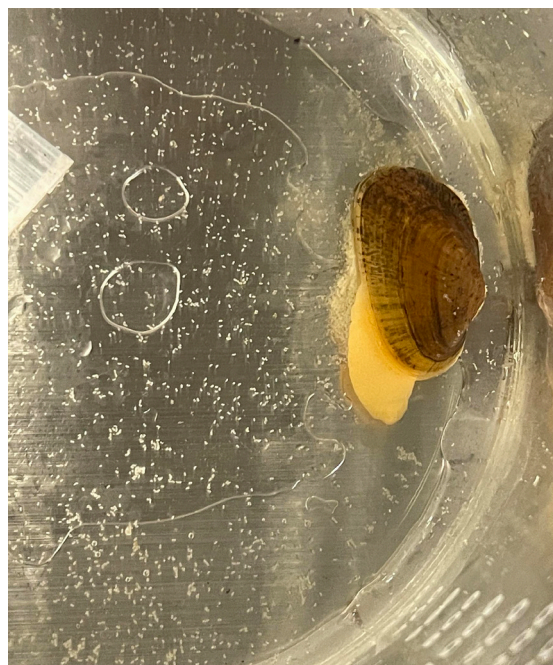
Brook Floater with glochidia, which look like grains of rice (Emilia Omerberg)

Staff collected Margined Madtoms, which were transported to the Yates Mill Aquatic Conservation Center in Raleigh. There, the fish will serve as hosts for the glochidia larvae of Brook Floater mussels that were collected from the Deep River in the fall of 2023. The young mussels will be grown out for stocking to help boost native mussel populations in the upper Cape Fear River basin.