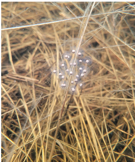
Tiger Salamander egg mass

Happily, numerous winter precipitation events yielded positive results for winter amphibian breeding efforts. Surveys for SGCN amphibians such as Gopher Frog, Eastern Tiger Salamander, and Mabee's Salamander yielded the largest number of egg masses detected at several sites in over 3 years. In the case of the Gopher Frog, two populations showed the largest number of egg masses ever detected. Head-starting efforts are well underway in partnership with the NC Zoo, the NC Aquariums, NCSU CMAST, Carteret Community College, and the USFWS Edenton National Fish Hatchery. These results are particularly exciting for the Holly Shelter game land population, which has seen significant restoration efforts over past two years. Over 50 egg masses were detected among 3 different ponds on the game land, each receiving some level of restoration from either Land and Water Access staff or Wildlife Management staff, or a combination of both.