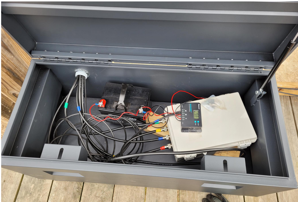
The Sensor Station, 12 V battery, and charge controller are housed inside a locked steel box, which is bolted to the platform (Chris Kelly).