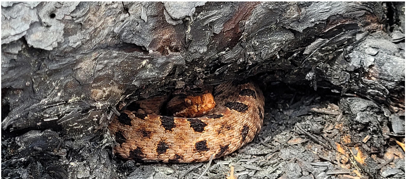
Carolina Pigmy Rattlesnake sheltering under a small log after a prescribed fire (Jeff Hall)

Warmer weather in March sent staff into the field searching for SGCN snakes and lizards. Staff often target areas that have recently received prescribed fire as tree stumps are more readily visible and thus more easily assessed in these more open landscapes, along with the snakes and lizards that often reside within them. Species detected during surveys included Carolina Pigmy Rattlesnake, Timber Rattlesnake, and Mole Kingsnake.