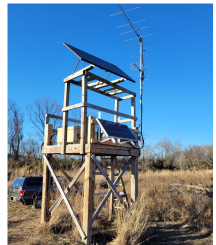
The Mud Creek Motus Station is co-located on a platform with NCWRC Muskellunge (fish) tracking equipment (Chris Kelly)

The Mud Creek Motus Station , located near Asheville Airport, was constructed in February 2024. This is another off-the-grid, dual mode station. However, given the low topography along the French Broad River, the team installed shorter antennas with fewer elements. This station is built on a raised wooden platform to clear floodwaters. It shares the platform with NCWRC's Muskellunge PIT tag reader station. The Sensor Station, 12 Volt battery, and charge controller are housed inside a locked steel box that is bolted to the floor of the platform to prevent theft.