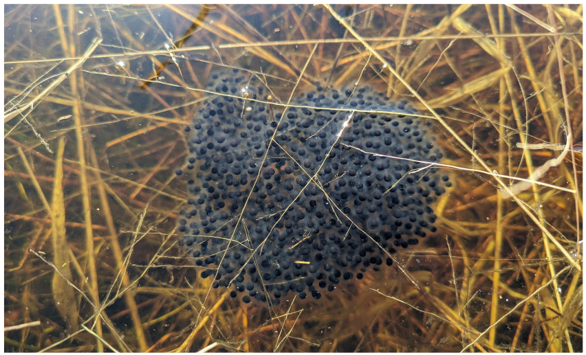
Aubrey H. Greene

since the first metamorphs were released at the reintroduction pond, and we are thrilled to announce the first calling males were observed and three egg masses were found in March! This is a huge win for the Carolina Gopher Frog and we hope for continued success as more frogs are released at the site.