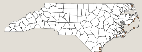
■ Snowy Egret Range Map