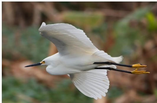
Dori @Commons Wikimedia