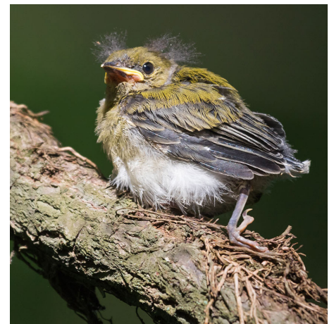
Prothonotary warbler chick (Jason Yoder)

1 to 2 years on average; very rarely to 5 years