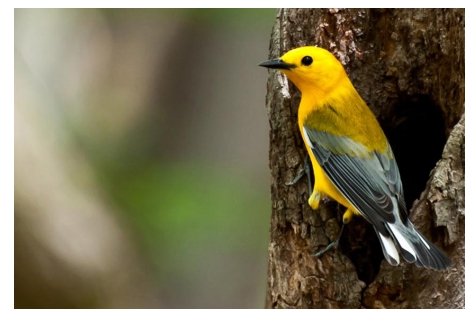
Prothonotary warbler (Jay Ondreicka)