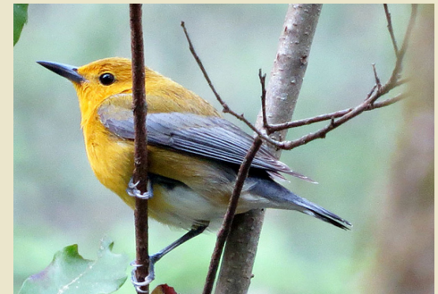
Female prothonotary warbler (Don Faulkner)