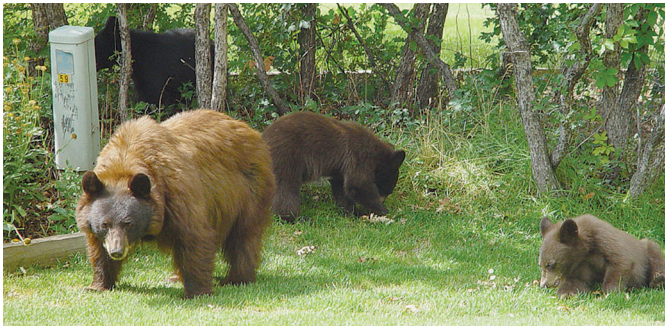
Don't force a mother black bear to defend her cubs.

If you live in or travel to bear country and own a dog, sooner or later your dog may encounter a bear. Understanding why some encounters end peacefully and others end with dogs and people being injured or killed can help keep people, dogs and bears safe.